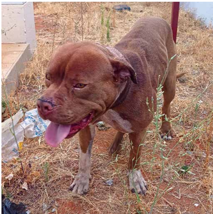
The pit bull dog that has allegedly mauled the 58-year-old victim at Manapyane Village outside Siyabuswa.